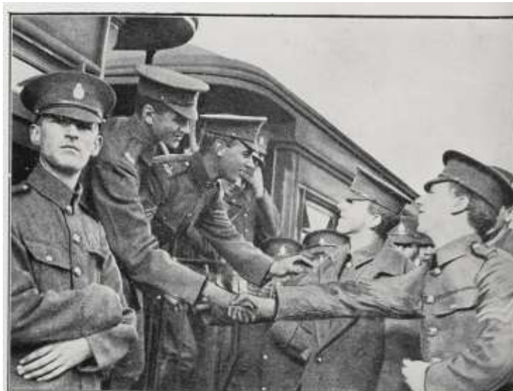
KIA-ORA: AUCKLANDERS FAREWELLING THE VOLUNTEERS AT THE RAILWAY STATION ON AUGUST 26.