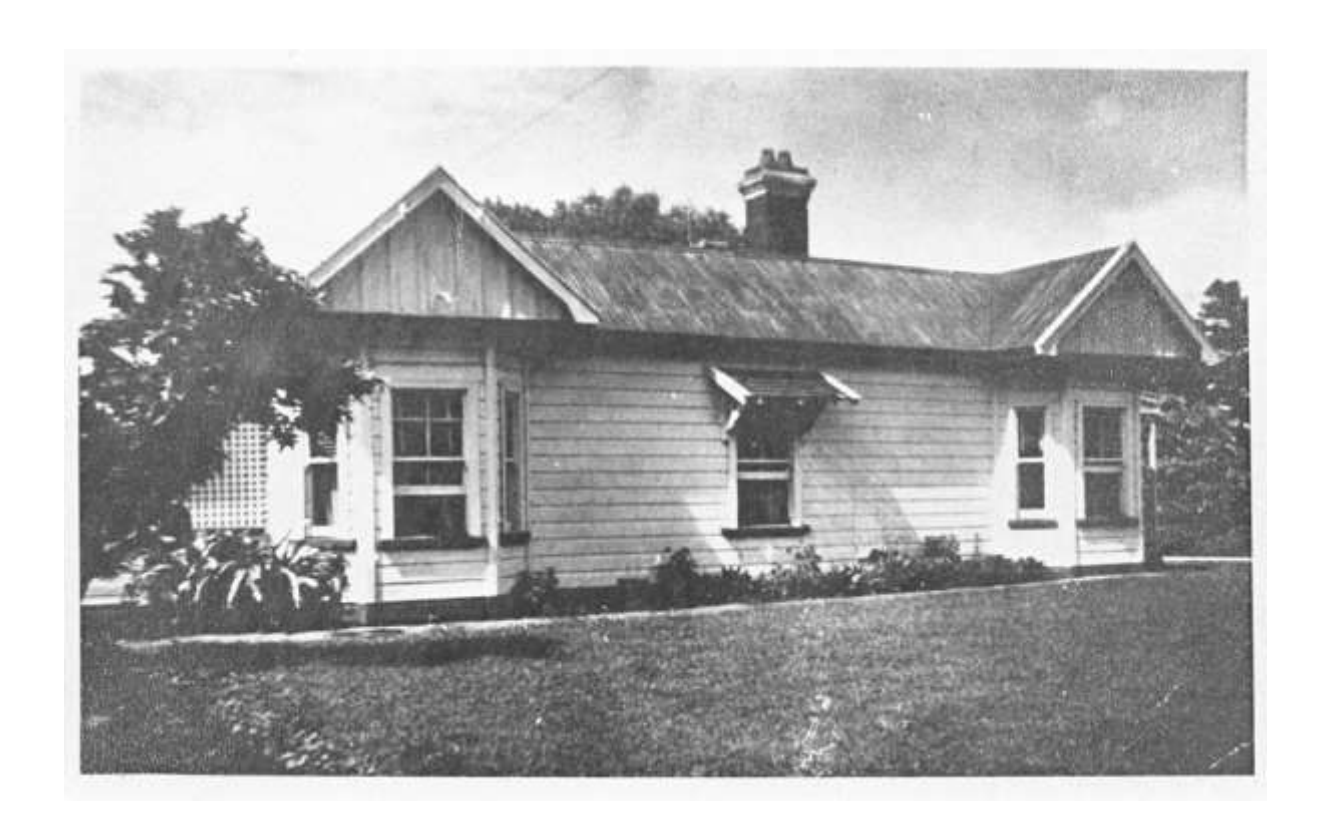
Wheeler residence Manuka Road, Glenfield