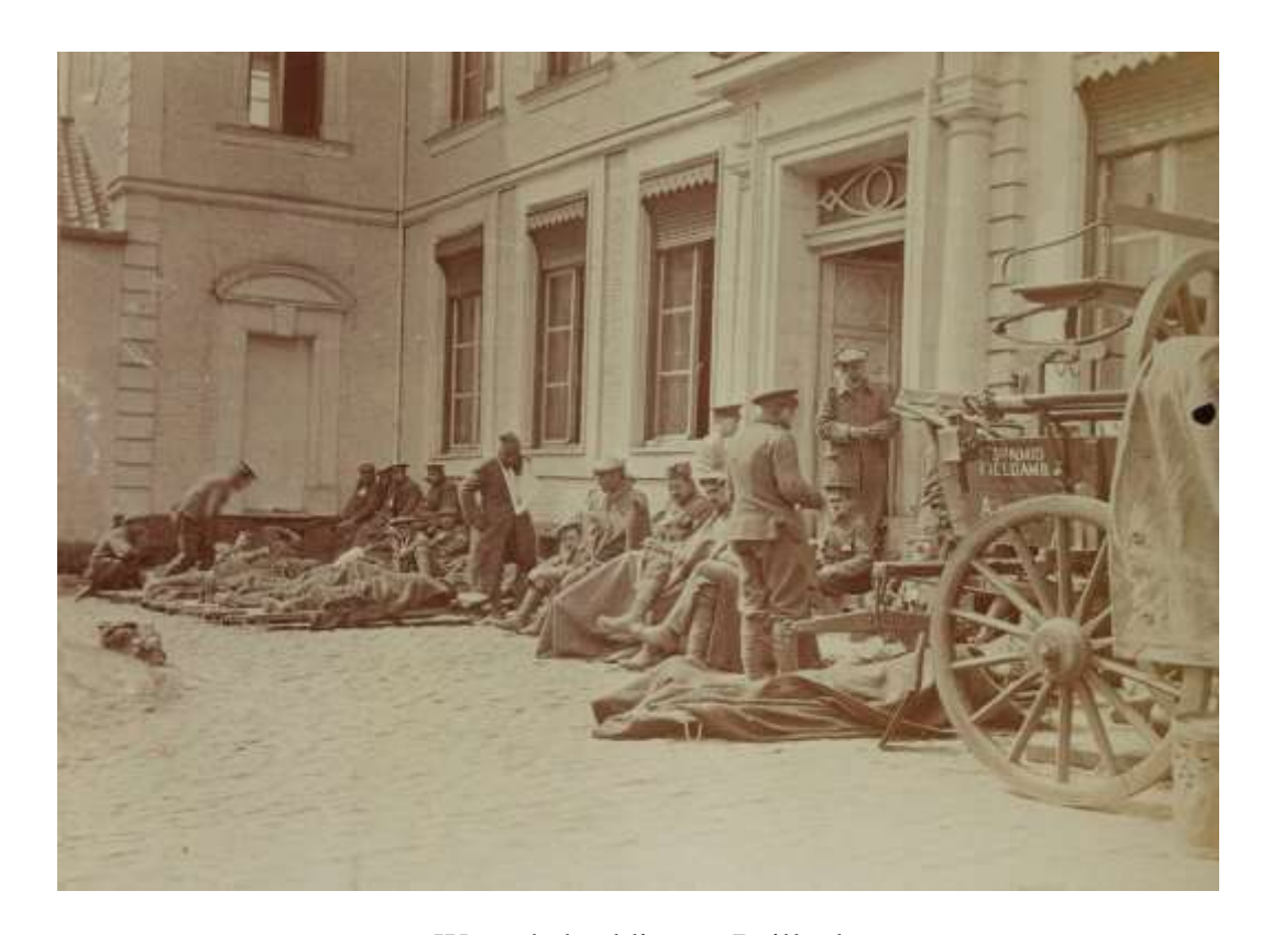
Wounded soldiers at Bailleul

"No 2 Casualty Clearing Station (or No 2 Clearing Hospital as it was called when it first got there) arrived at Bailleul on the 18th October 1914 and opened in a seminary about a mile from the railway station Taken from the Official History " – GWF