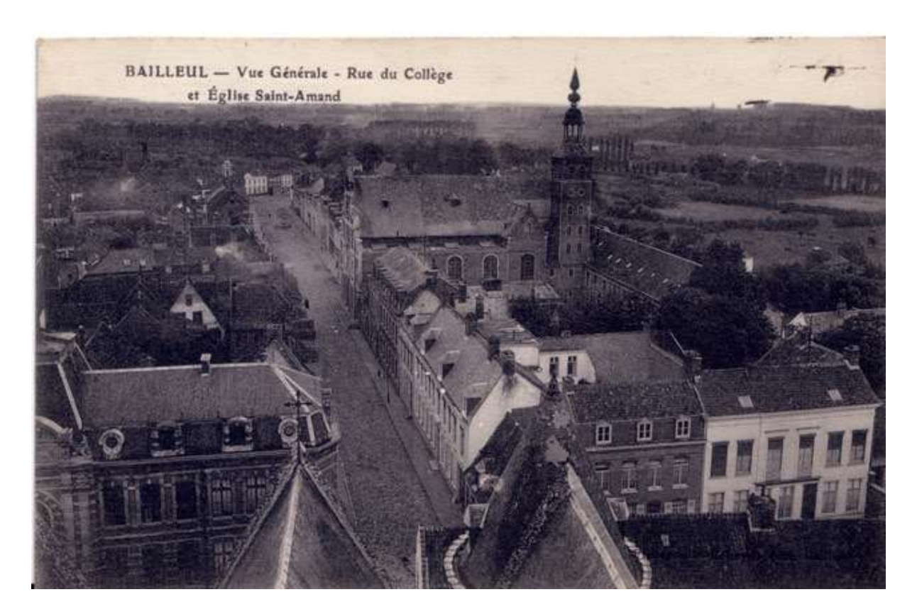
On the right of Rue du collège is the church of St. Amand and the college. This photo was taken from the top of the church of St. Vaast.