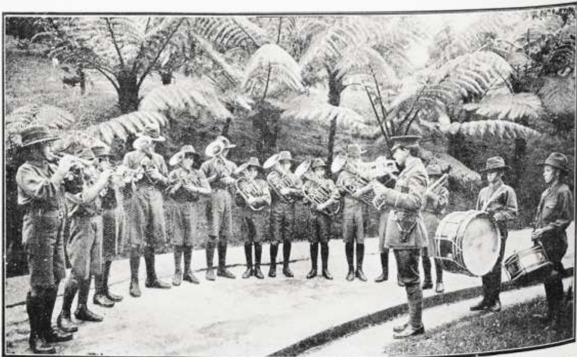
CLAIMED TO BE THE FIRST OF ITS CLASS IN THE DOMINION: THE AUCKLAND SEDDON MEMORIAL TECHNICAL COLLEGE SENIOR CADET BRASS BAND.