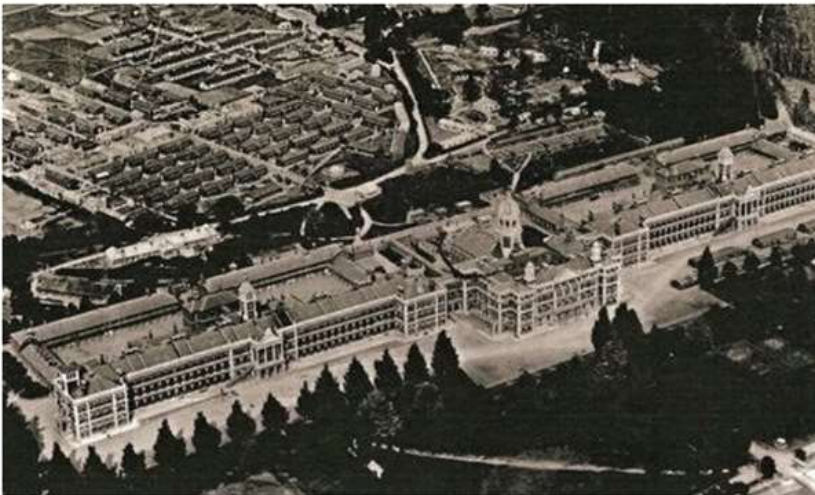
An aerial photograph of the Royal Victoria Hospital at Netley, Hampshire, in the first world war.