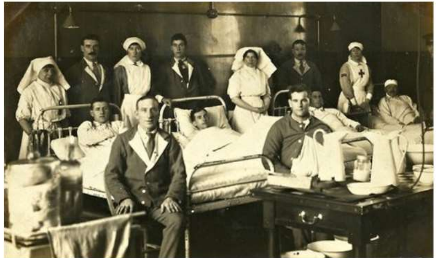
Staff and patients on a ward at Royal Victoria Hospital, Netley, in the first world war.