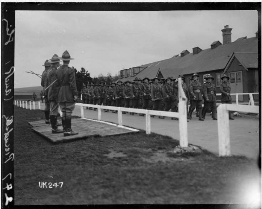
Men of the Auckland Battalion performing the 'Piccadilly' or regular march past officers at Sling Camp, England. Ref: 1/2-014050-G.