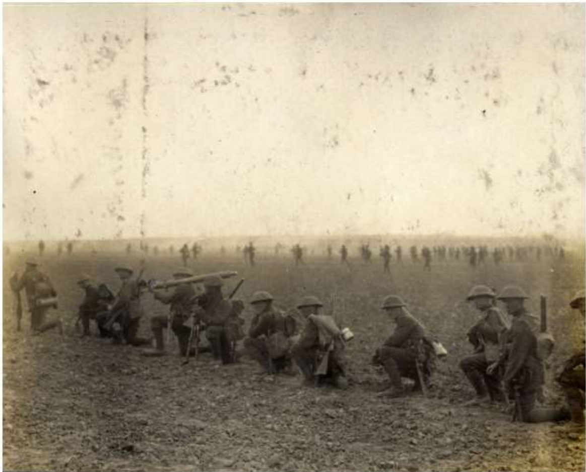
New Zealand troops training for Messines